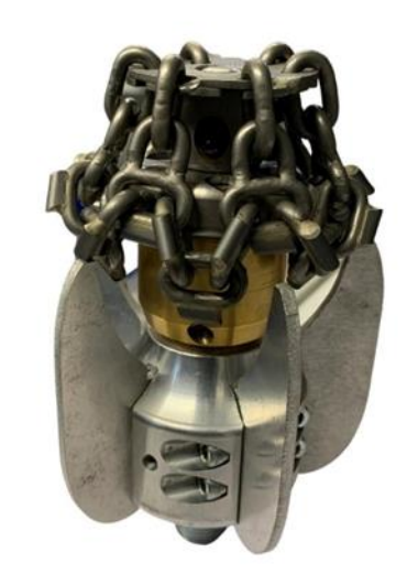
Chain Cutter £360