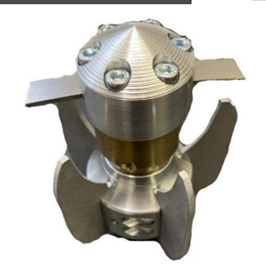
Root Cutter £360