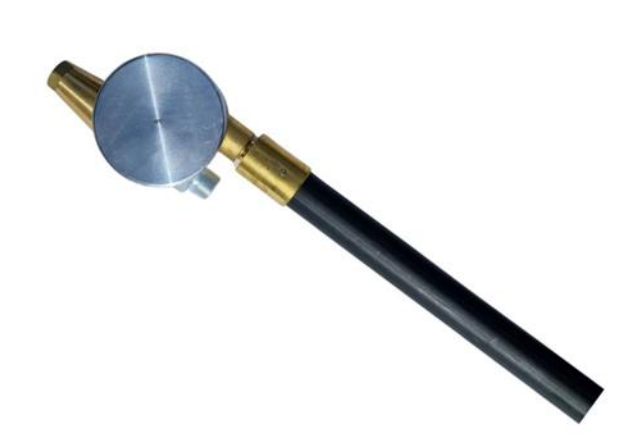
Spinning Push Through £120