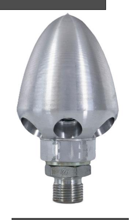
Tulip Nozzle x3 £200