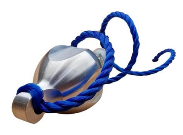
Rope Pulling Nozzle £95