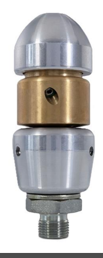
Spinning Nozzle £199